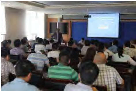
Figure 1 Workshop delivered by Monideep Dey

Dr. Dey is available to provide a workshop or lecture on the use and benefits of using ISO/IEC TR 17032 to develop schemes for the certification of fire safety designs based on fire safety engineering.